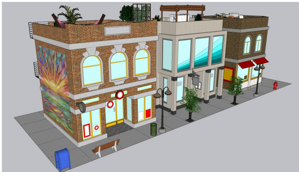
Example of a Sketch-Up city block